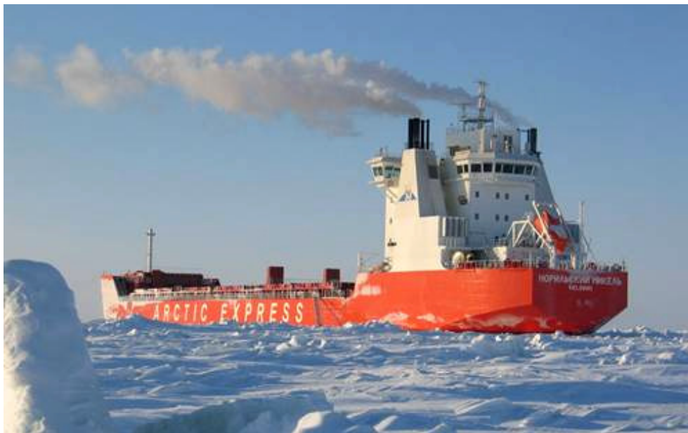
Icebreaking (Double Acting) Container Ship: Norilskiy Nickel on the Northern Sea Route (March 2006)

shown recently that modern icebreaking commercial ships can operate in this region without the need for icebreaker convoying.