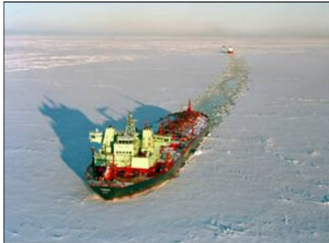
Double Acting Ship Aker Arctic DAS™

The main technological challenges in ship design must take account of the following: